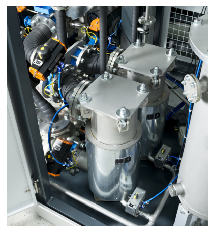
Filter monitoring and drying