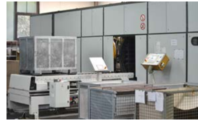
Cleaning parts in mesh boxes holding up to 1,000 kg