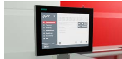
User-friendly control interface