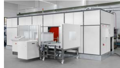
Automatic charging unit with 3 slots for extra high throughput