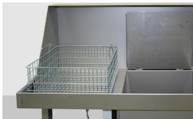
Cleaning basket in drip position