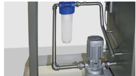
Pump and filter